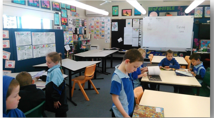
Yellow Learning Group in the library last week.

Don't forget to return your library books!