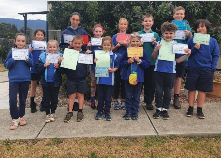
Our PBL, Bemboka Brilliance and MiniLit Certificates of Completion award winners. Great work! Well done!